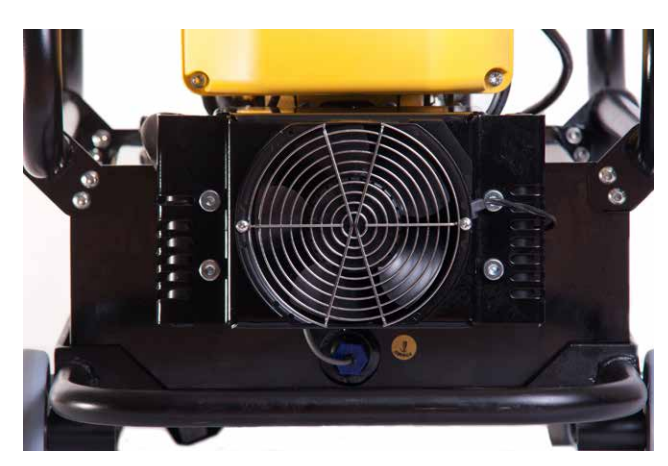
Reservoir heat exchanger