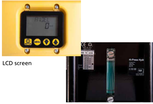
Full sight oil level glass